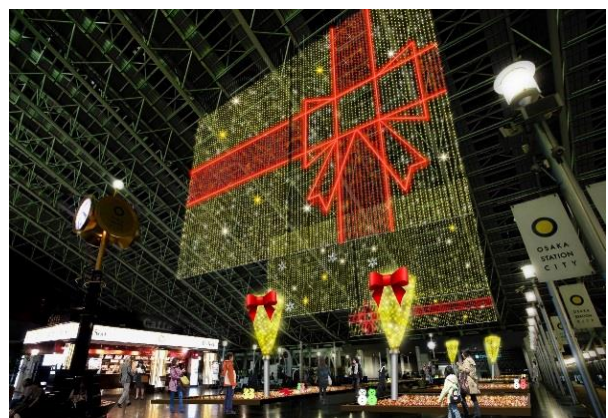
(Top) Main visual (Bottom) Artist's impression