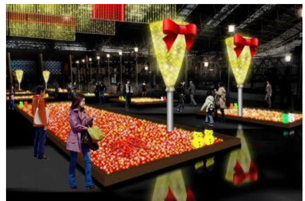
<Streets of light>

On every hour and half hour, the "night sky ribbon veil", "gift posts of light" and "streets of light" illuminations will synchronize with music in a special display. Twice every hour, visitors can enjoy watching the illuminations change in time with the music.