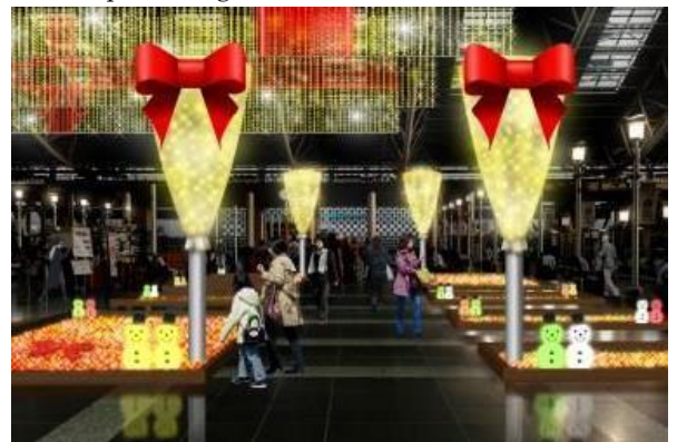
<Gift posts of light>

As the visitors move further into the plaza they will encounter such things as glittering gift boxes shaped as ribbons and hearts, so that they can enjoy walking around the plaza and taking in the illuminations.