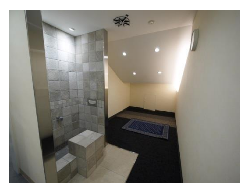
Prayer room interior

In addition to this, the Osaka Station City has had the following initiatives for international passengers visiting Japan.