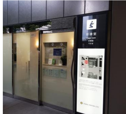
Prayer room exterior